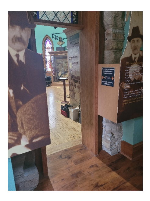
The entryway into the angel room from the stair tower measured 33 inches