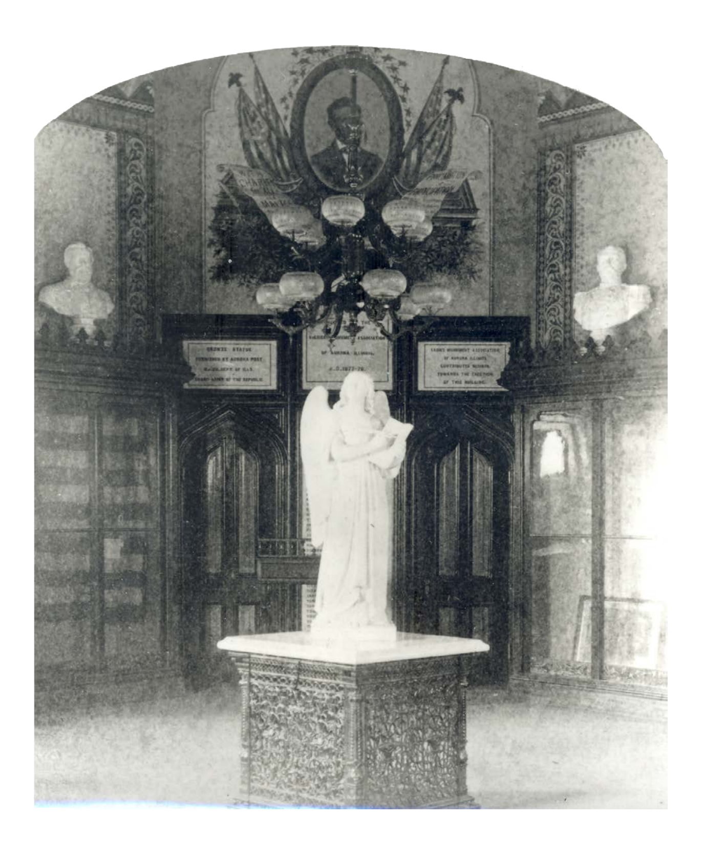
Page 5 of 5