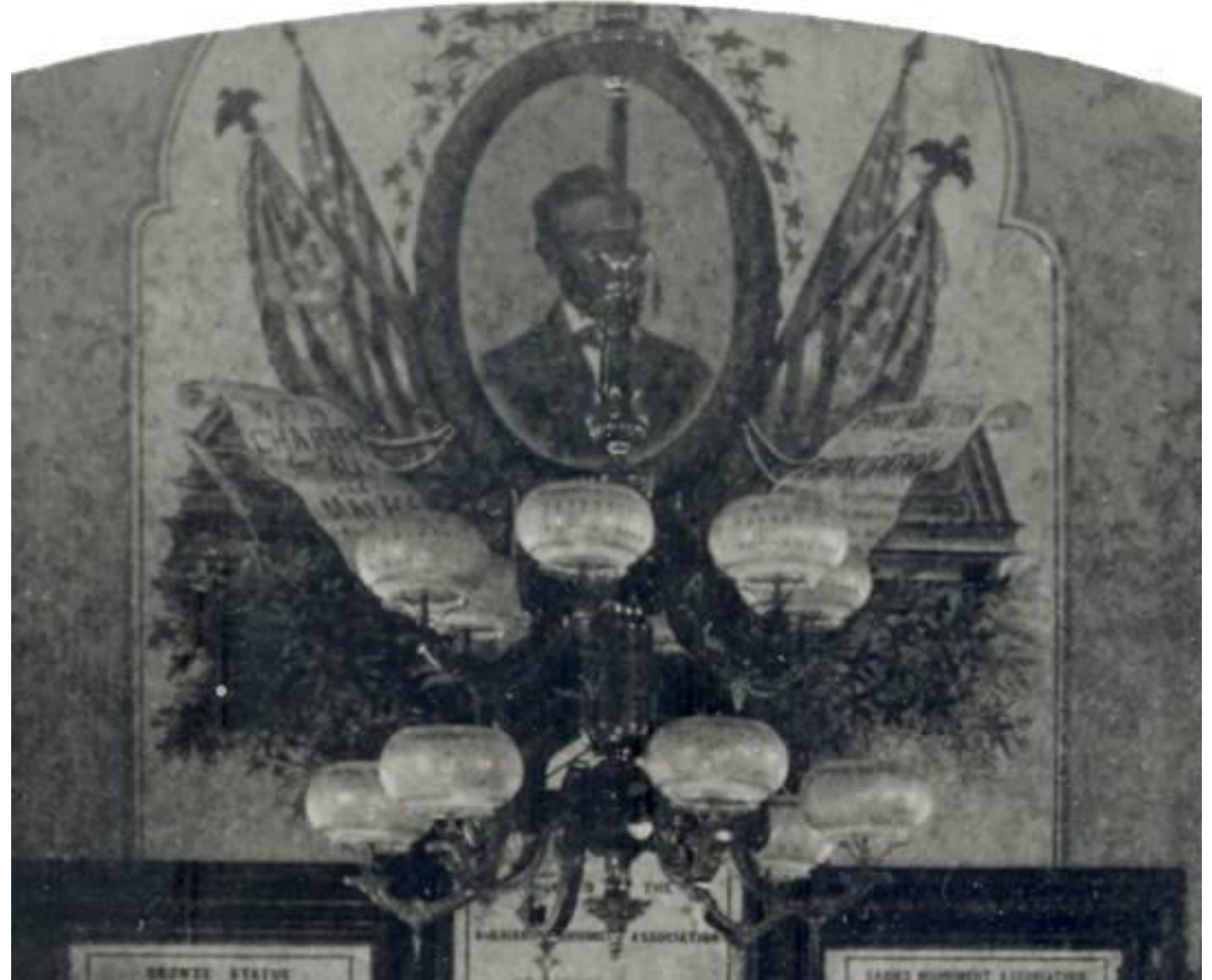
Southern Mural, C. 1880

Murals created using a fresco-secco method. Fresco-secco is painting directly onto plaster. Colloquially referred to as murals within all proposals and internal documents.