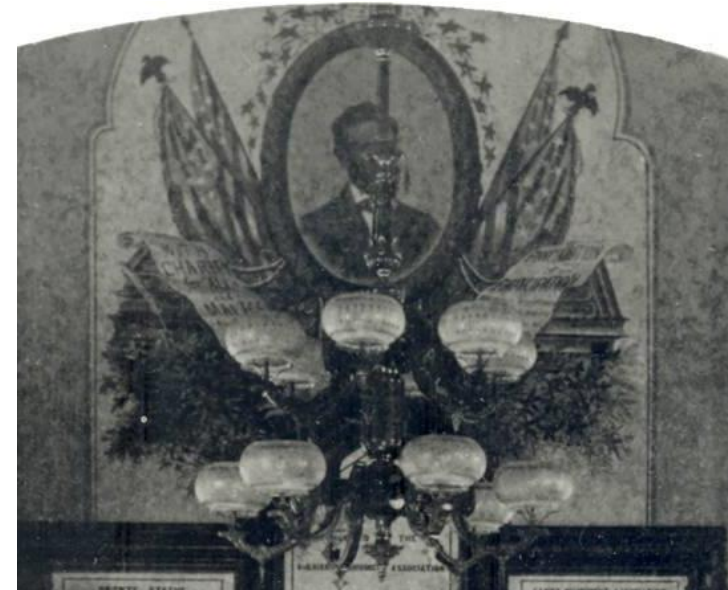
Southern Mural, C. 1880

Missing portions under mural will not be replaced.