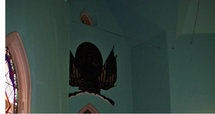
West mural, 2013. Mural is too dark to see details, but flags are prevalent.

The west mural depicts General George Thomas. Many of the members of G.A.R. Post No. 20 fought in regiments under General Thomas' command. A consultant believes this mural has undergone at least one round of restoration but was not done professionally. The stripes of the flags are much brighter than the others, and the stars are not symmetrical.