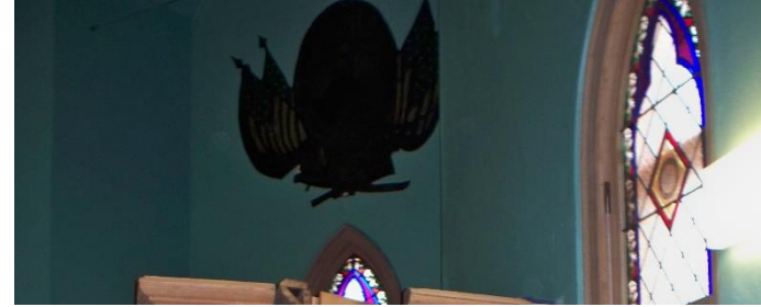
East Mural, 2013. Mural is too dark to see details

The east mural depicts Admiral Farragut. Farragut served in the American Civil War and proved to be vital to the Union cause. Historic photographs of this mural are not available or do not exist.