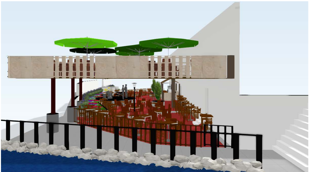
View from River Edge looking West