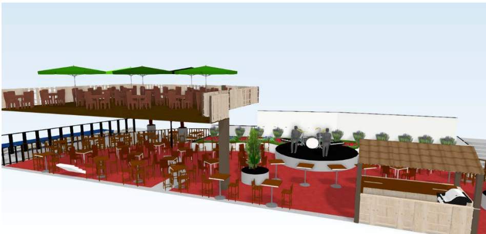
View of Back Alley West