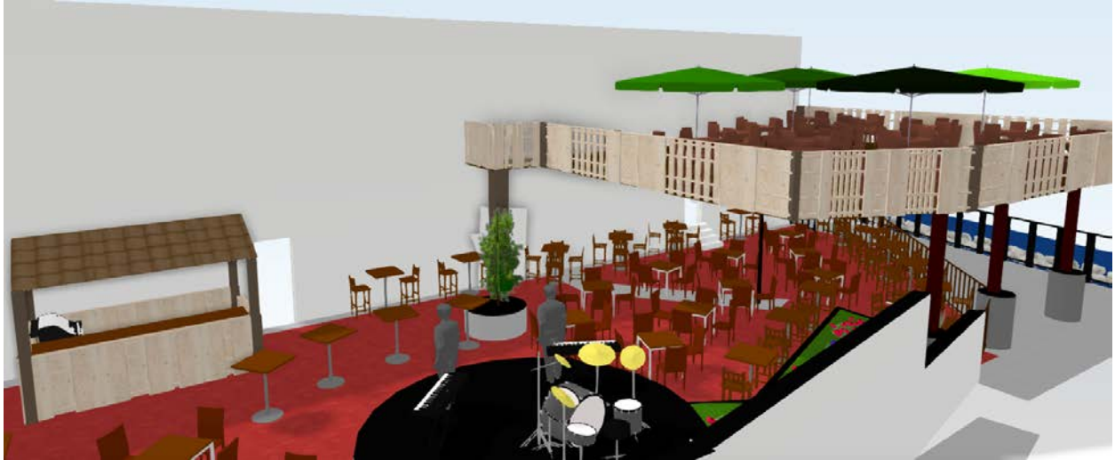
View from Center looking East