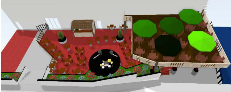
View of the Food Vending Structure