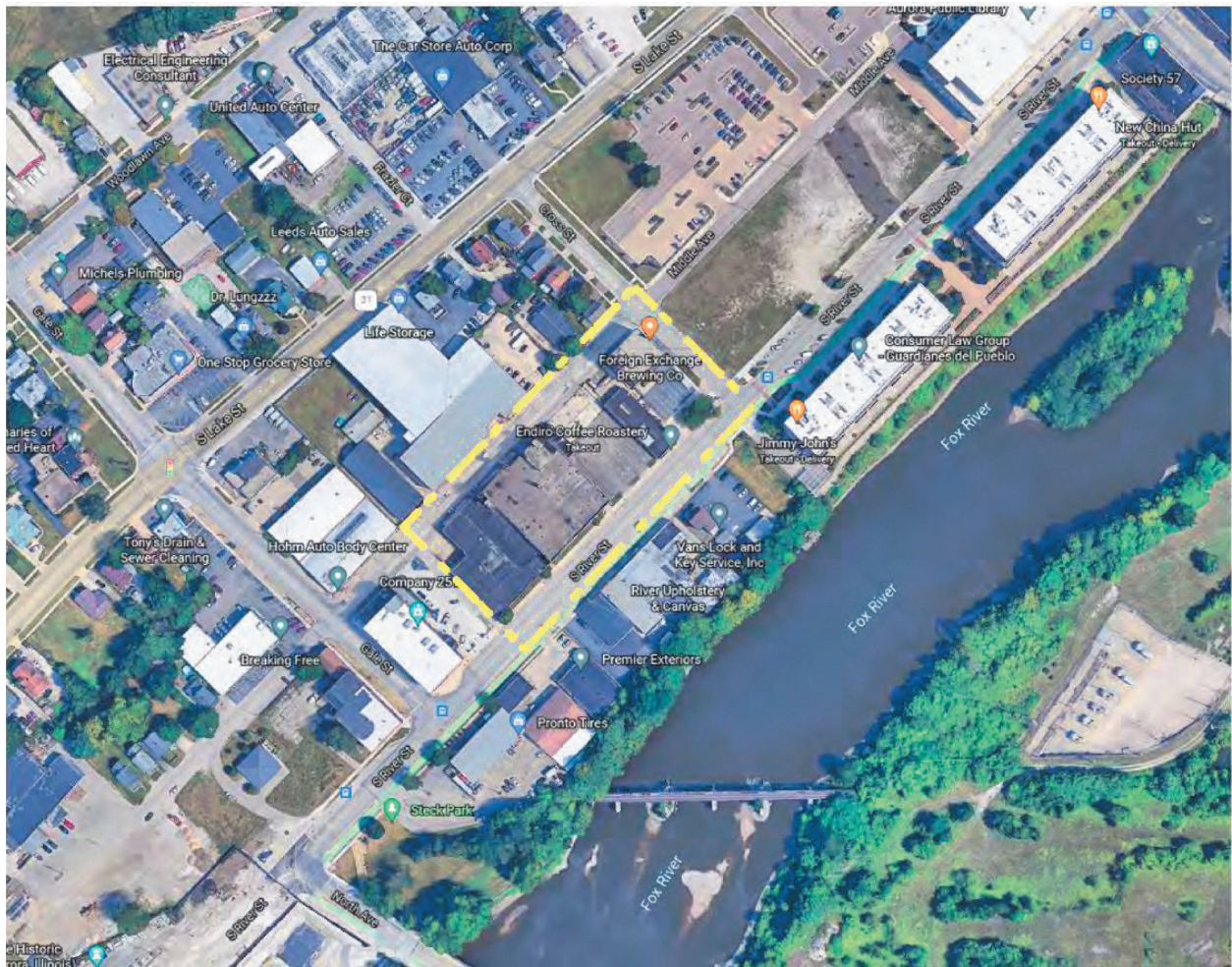
EXHIBIT 2 BOUNDARY MAP