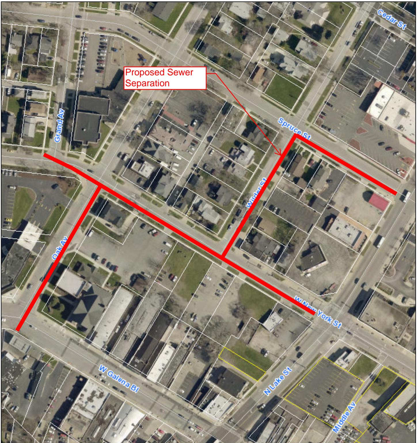
Exhibit A - Location Map