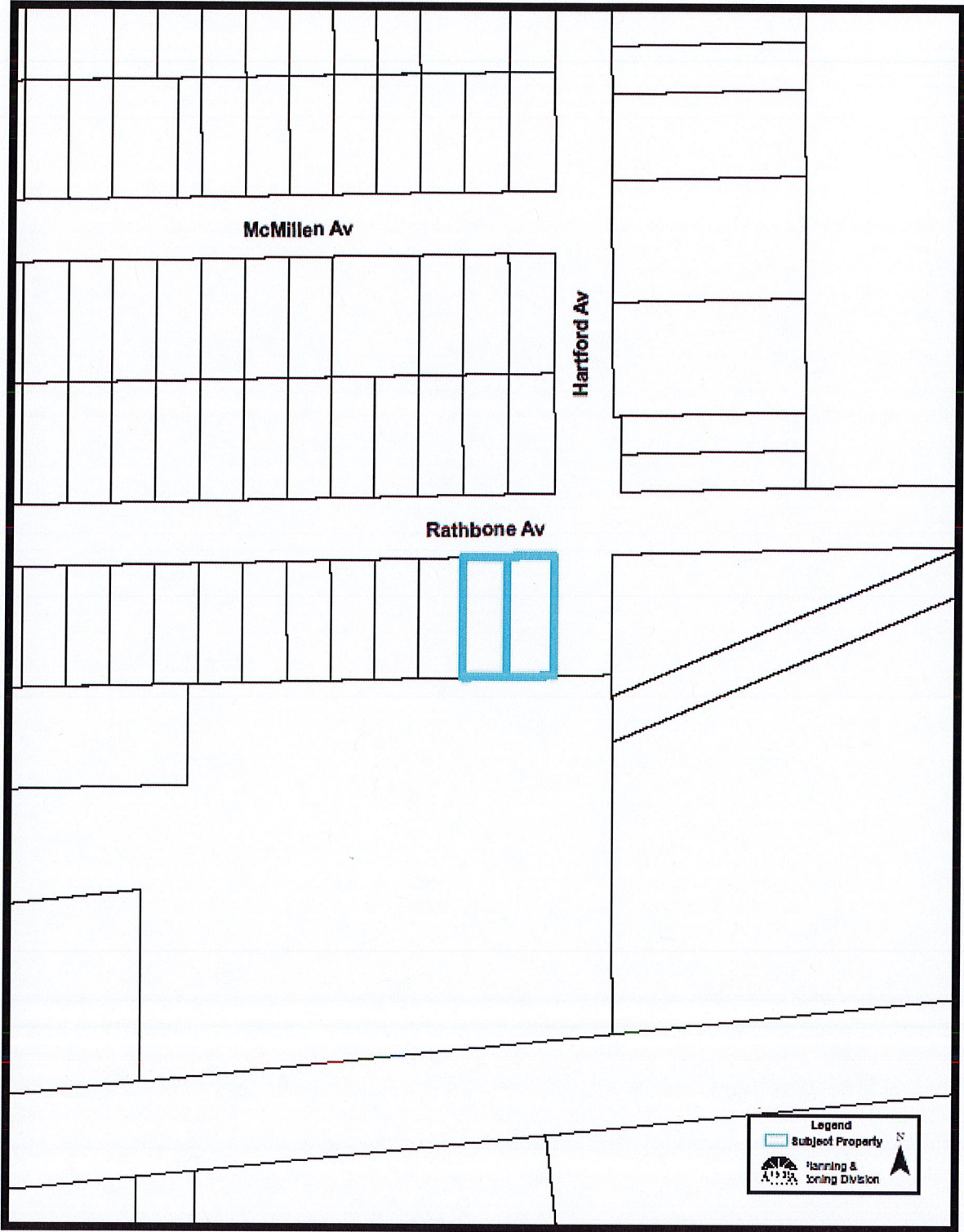
Location Map (1:1,500):

For the property located at 1102 Rathbone Avenue