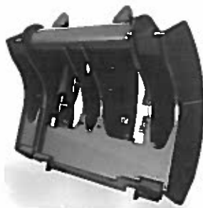
QUICK COUPLER, FUSION