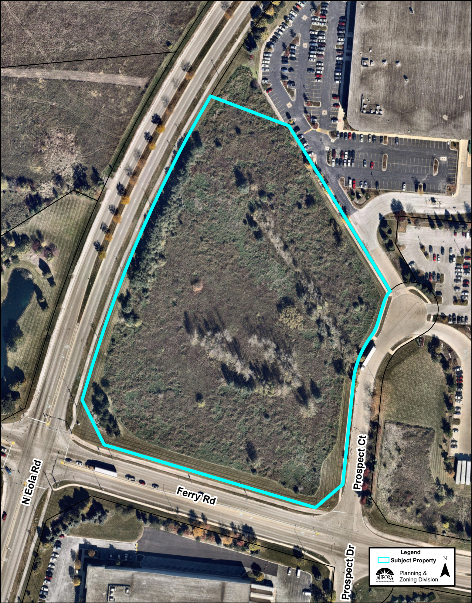
Aerial Map (1:1,500):