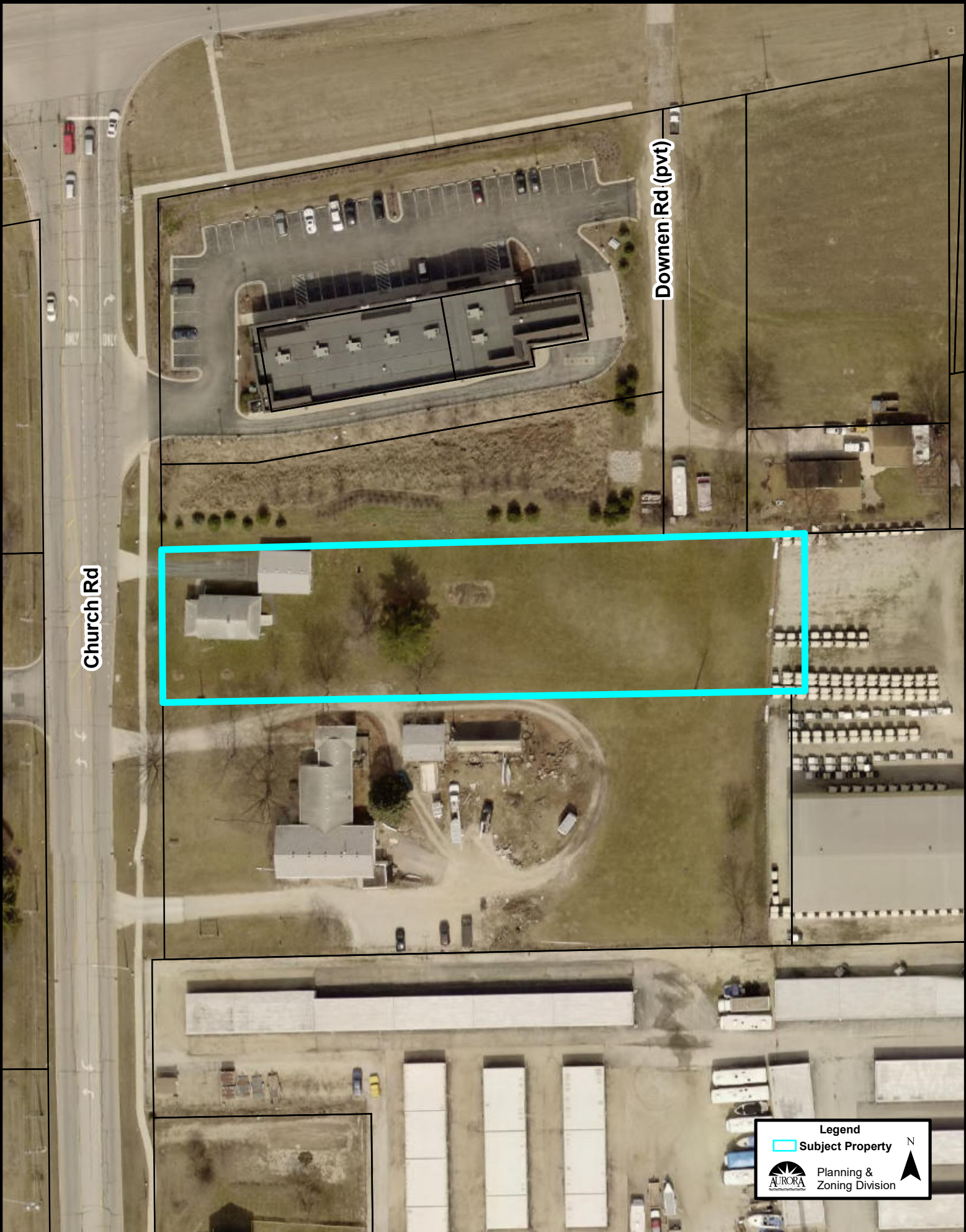
Aerial Map (1:1,500):