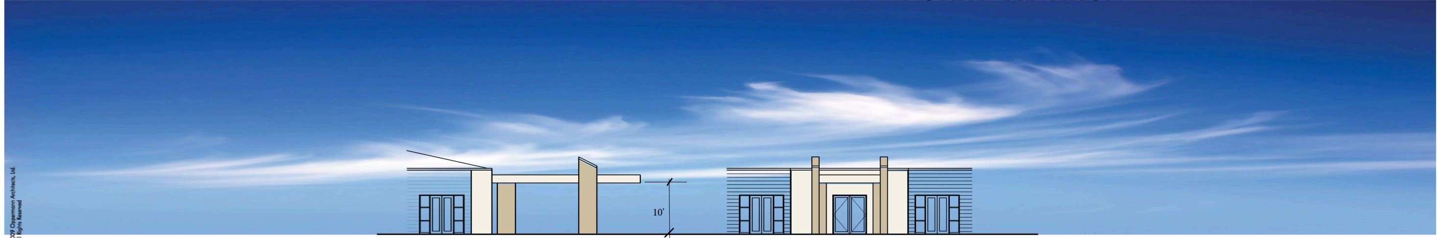
CANOPY SOUTH ELEVATION