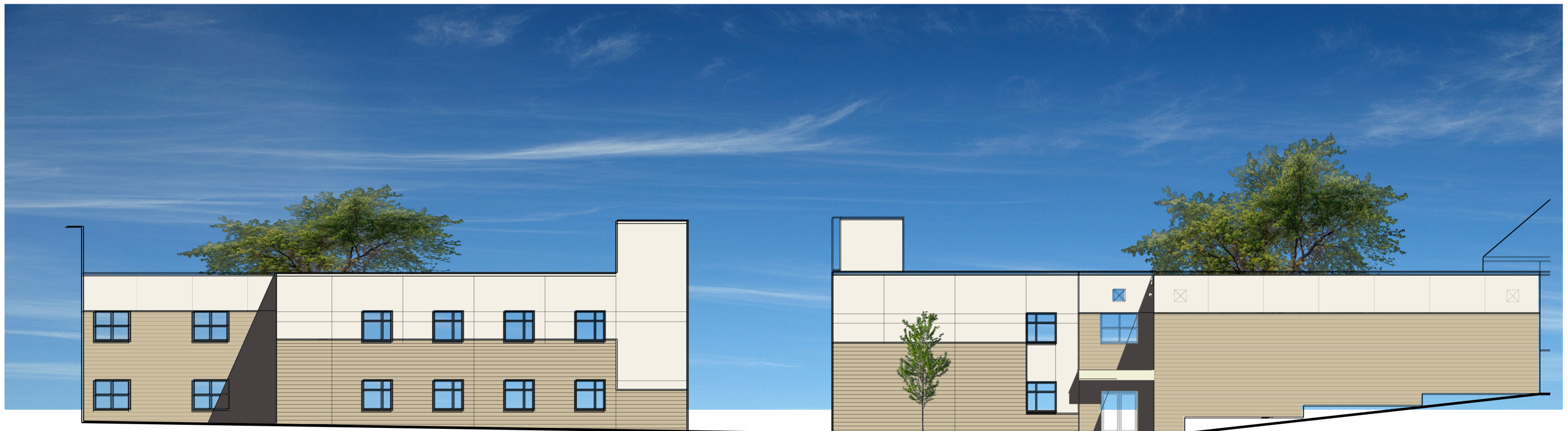
EXISTING PROPOSED ADDITION NORTH ELEVATION