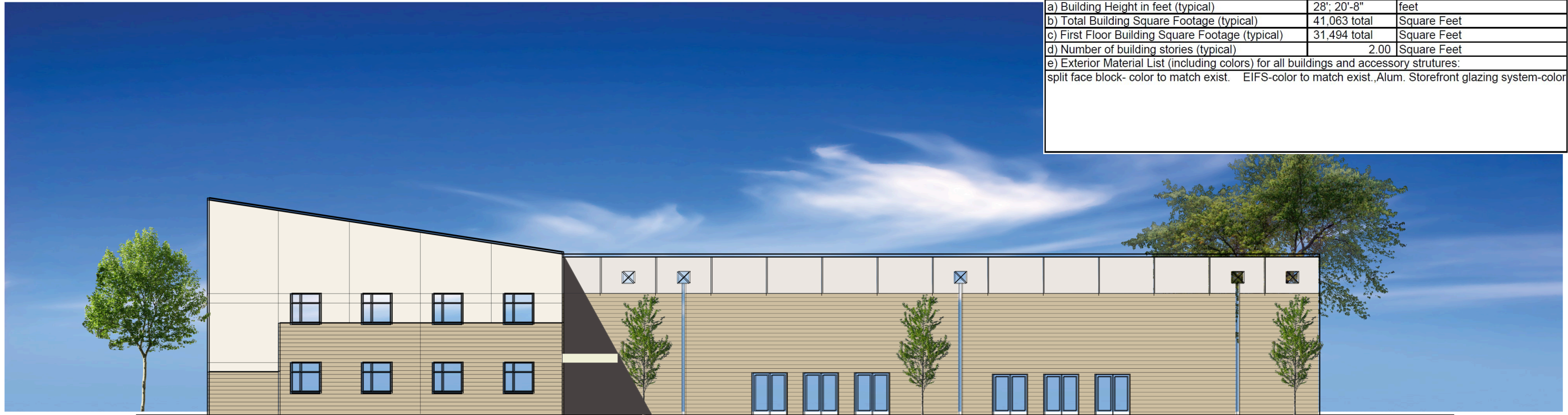
PROPOSED ADDITION EXISTING WEST ELEVATION