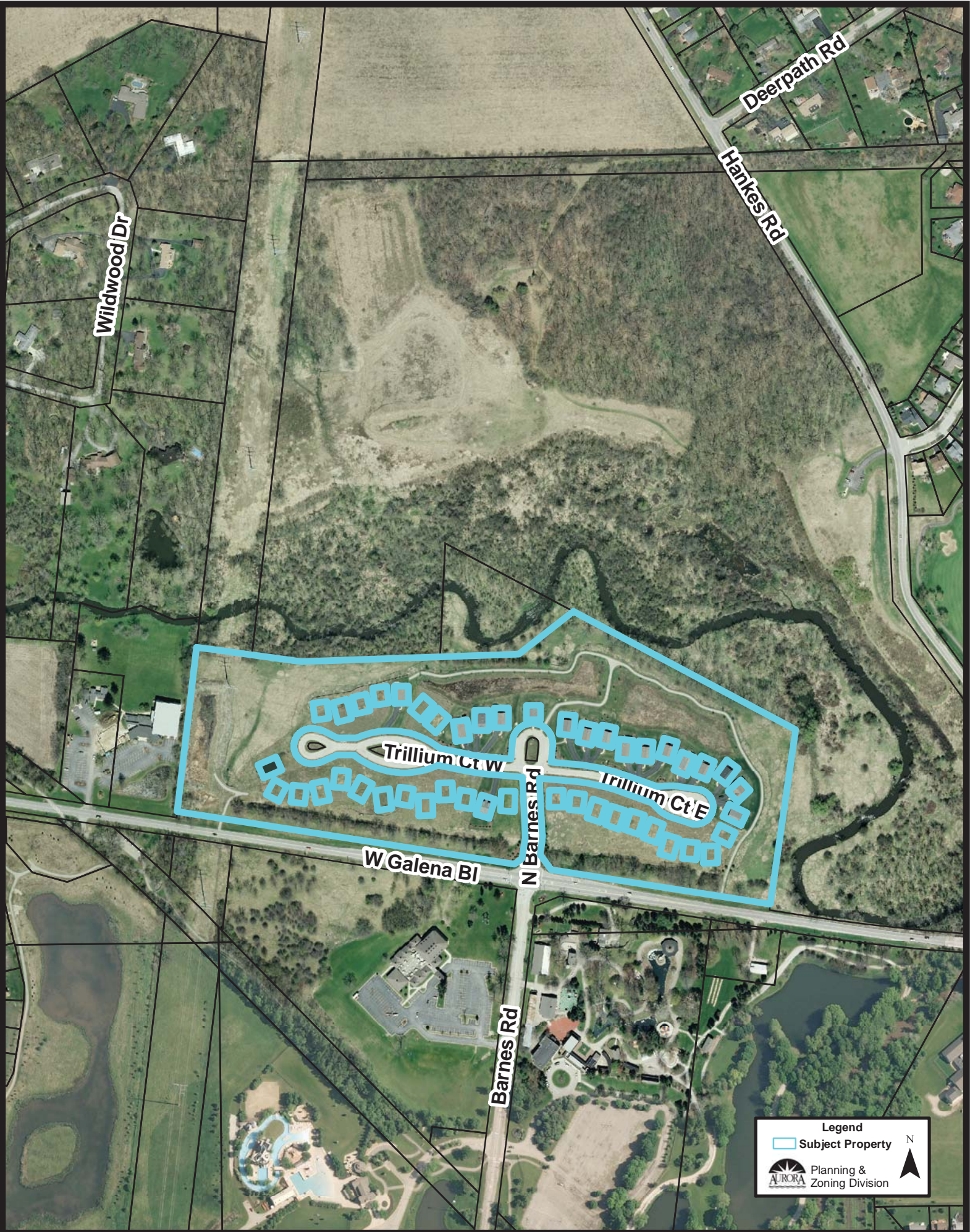
Aerial Photo (1:5,000):