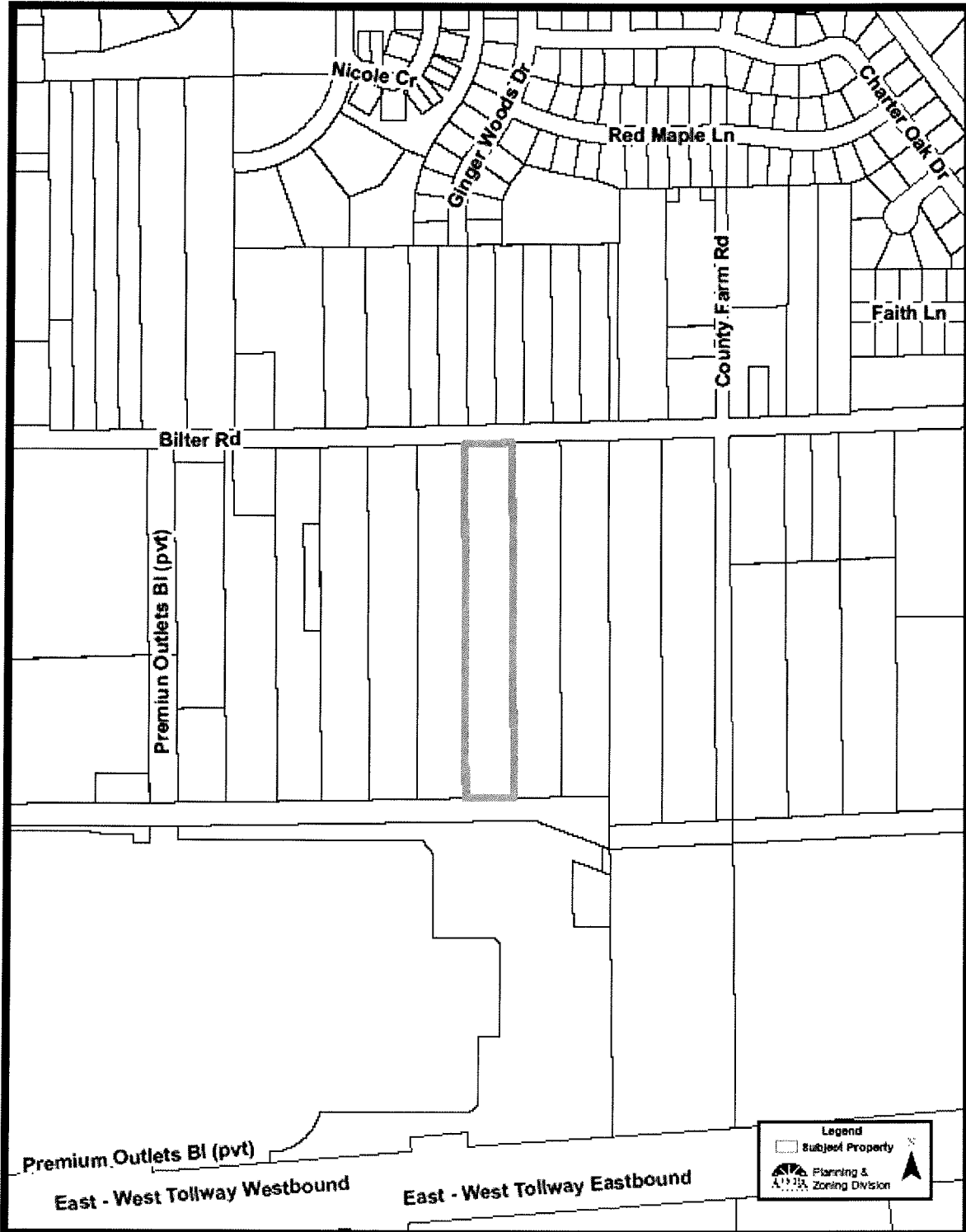
Location Map (1:5,000):

For the property located at 2065 Bilter Road