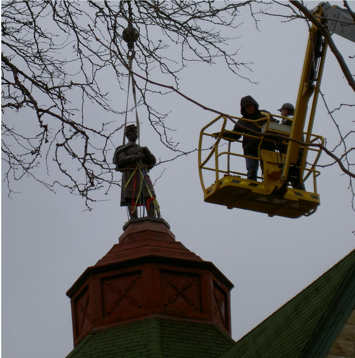
Sentry Statue is removed from the roof of the GAR Museum in 2008, as part of ongoing restoration project.