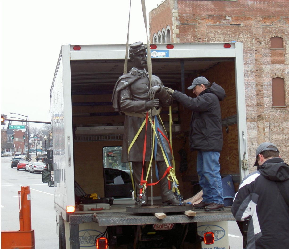
After being removed from the top of the GAR Museum in 2008, the Sentry Statue was taken away for safe storage.