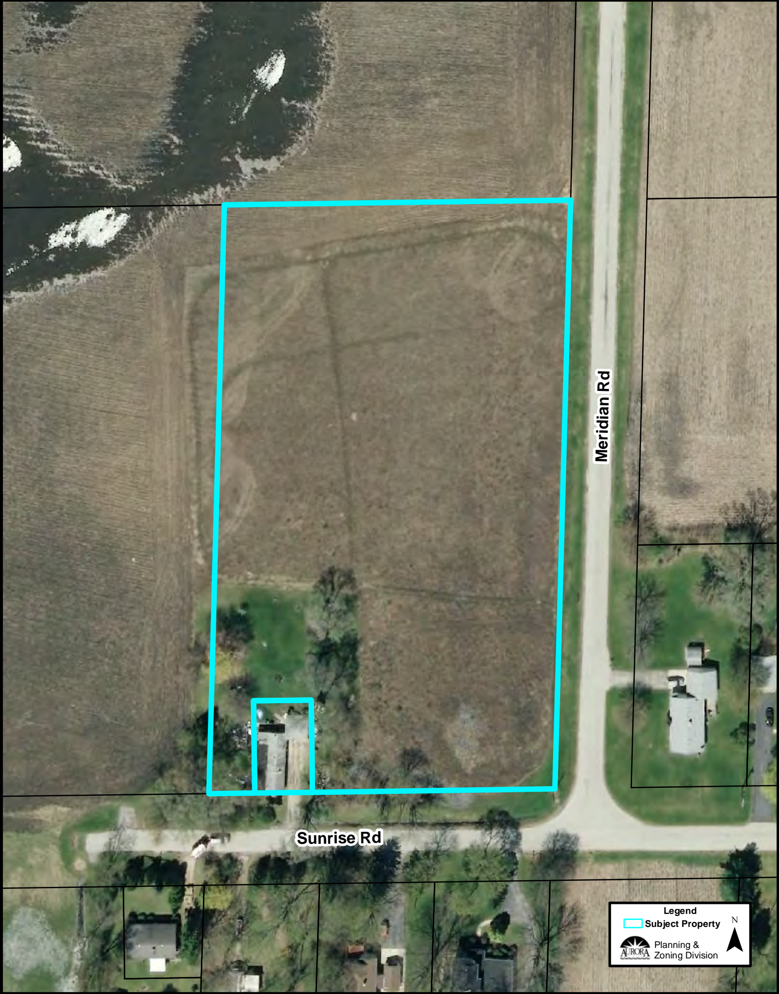
Aerial Photo (1:1,000):