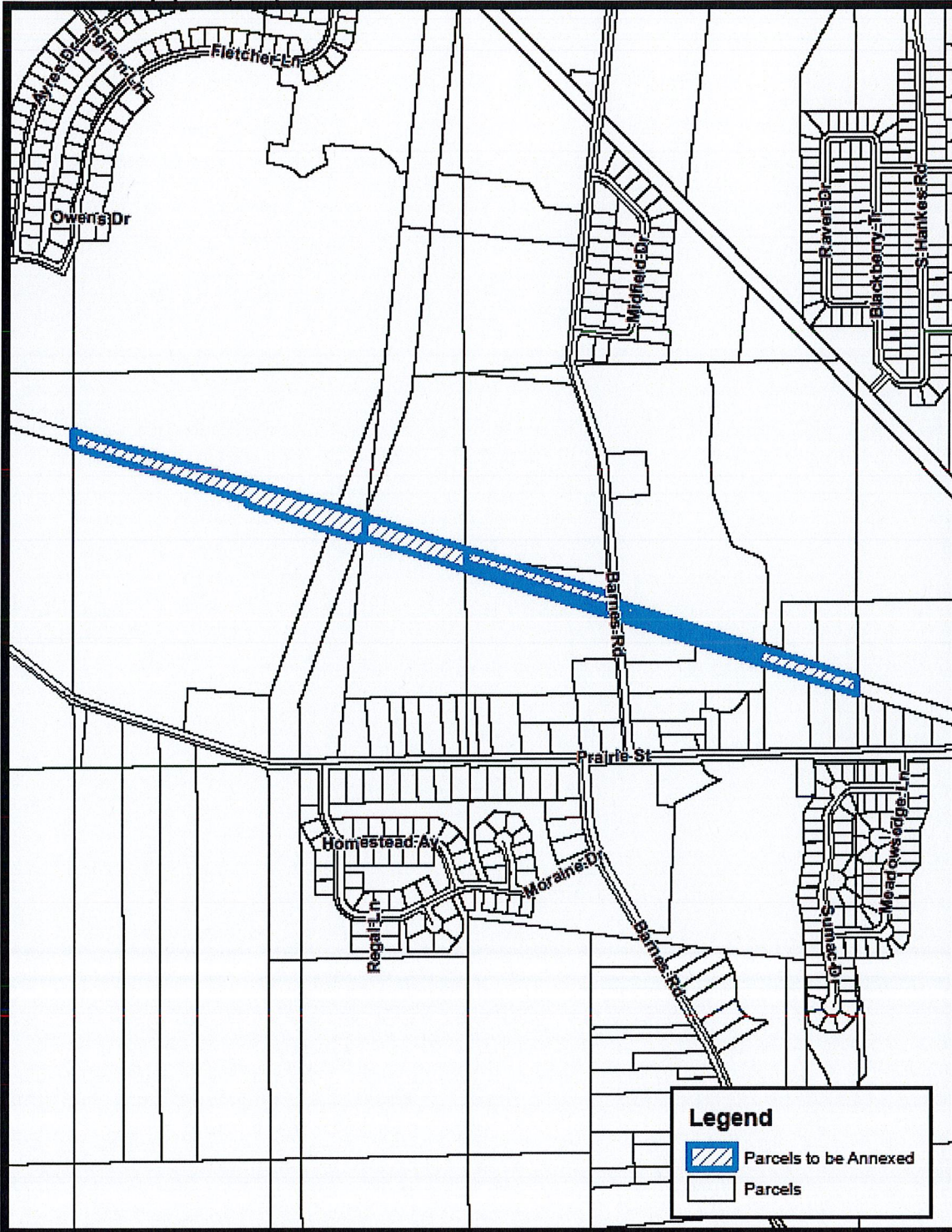
Location Map (1:10,000)

For a portion of the BNSF Railroad property generally located at East of Gordon Road and West of Orchard Road, in Sugar Grove Township, Kane County, Illinois