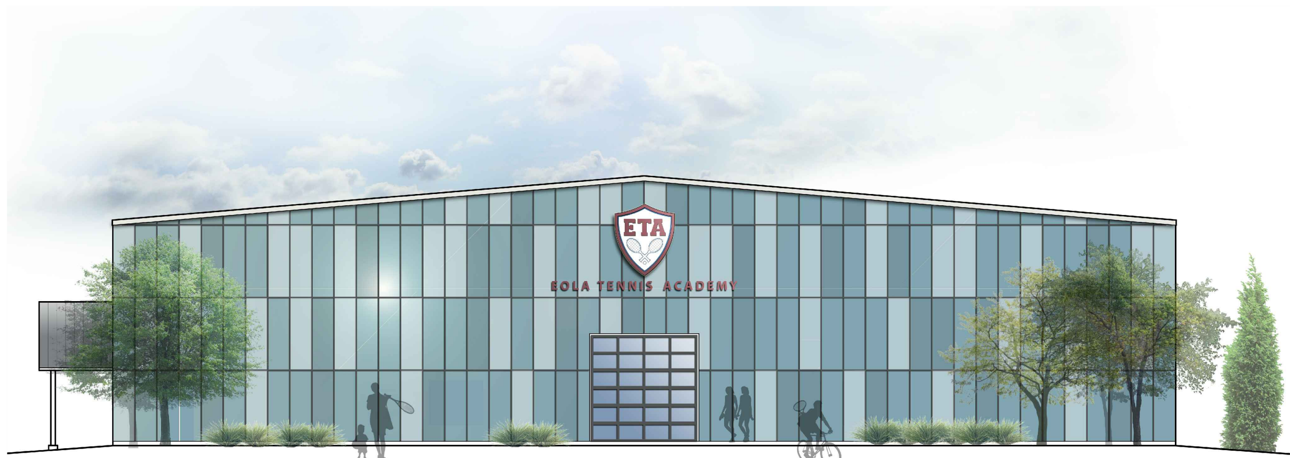
SOUTH ELEVATION SCALE: 1:10