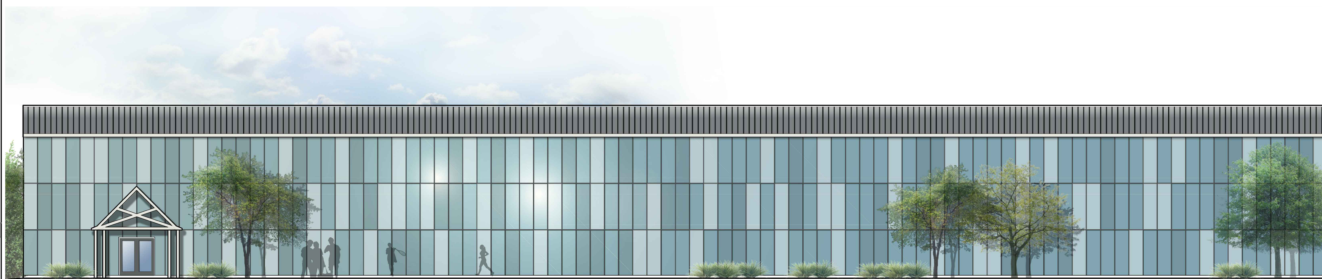
WEST ELEVATION SCALE: 1:10