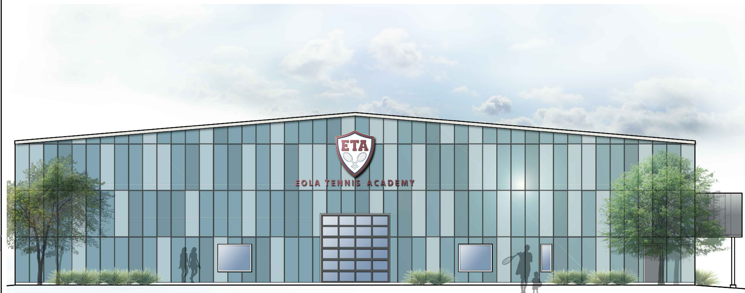
NORTH ELEVATION SCALE: 1:10