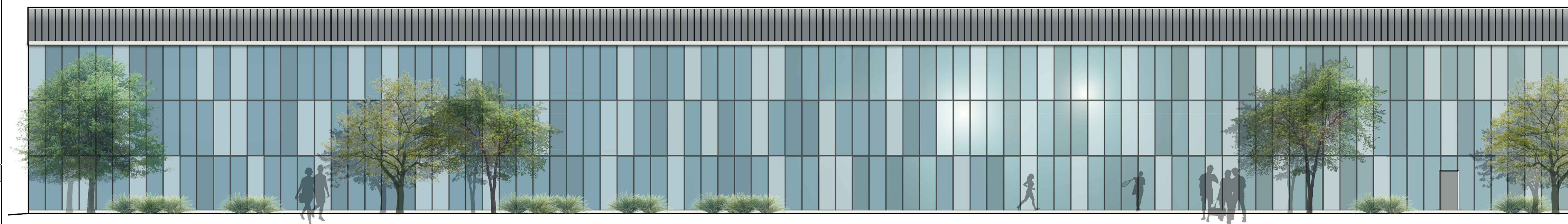
EAST ELEVATION SCALE: 1:10