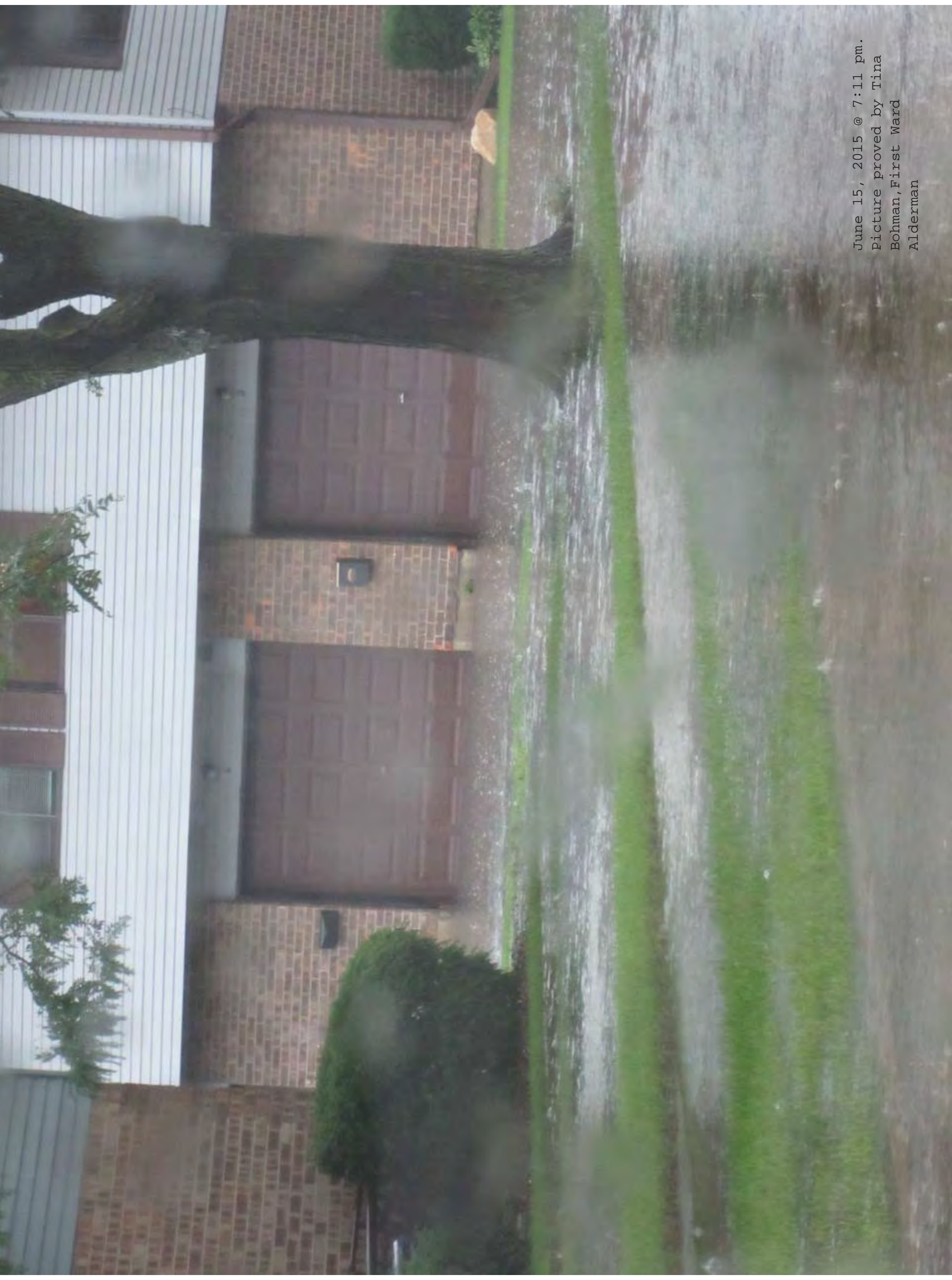
June 15, 2015 @ 7:11 pm.