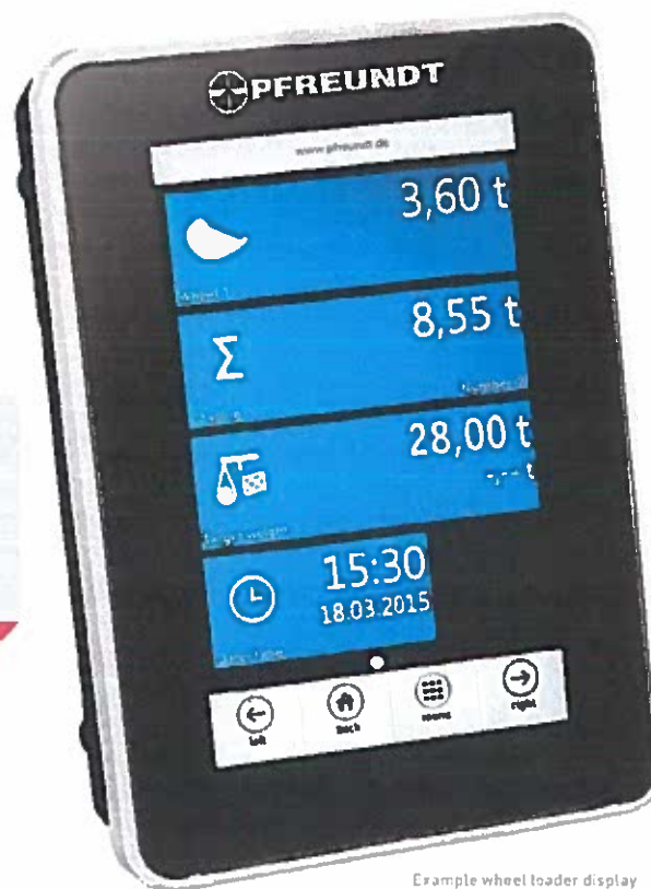
Example wheel loader display