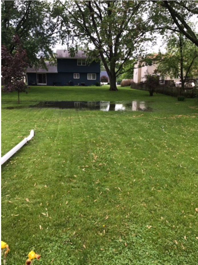
Rear Yard of 2360 Sans Souci Drive Looking South