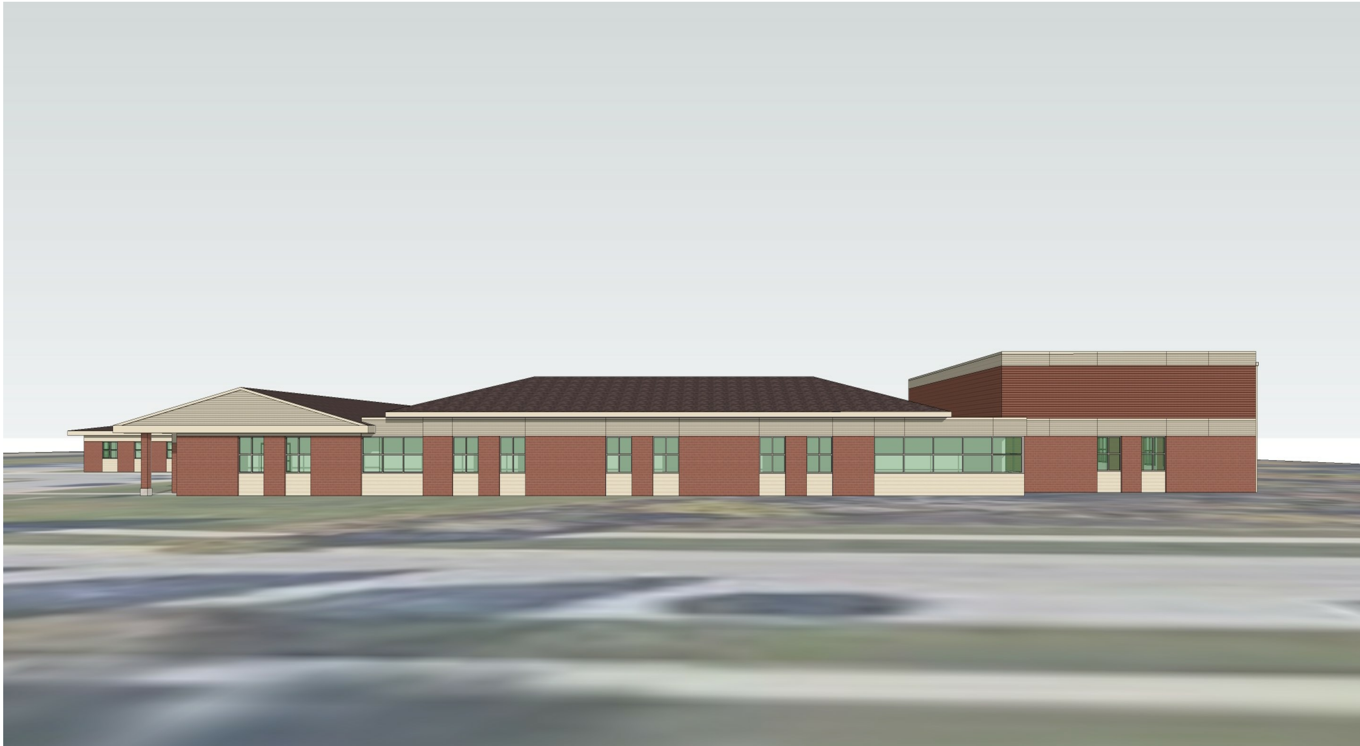
3 PERSPECTIVE VIEW