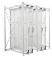
Single System with Adder