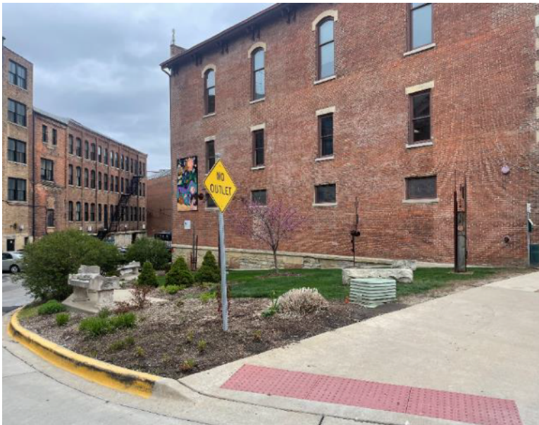
Approximately 8% grade south to north