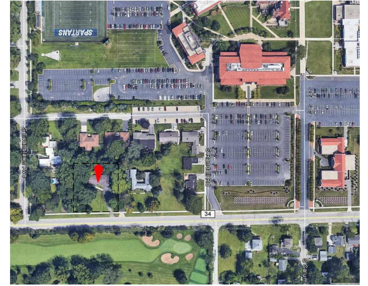
PROJECT LOCATION MAP NOT TO SCALE