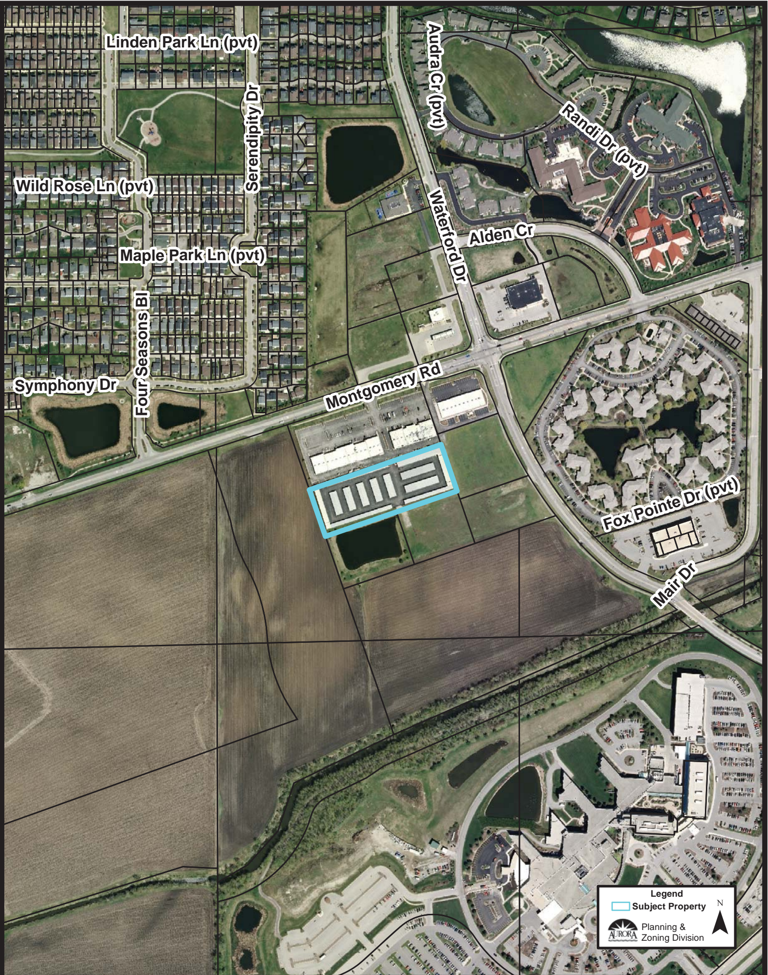
Aerial Photo (1:5,000):