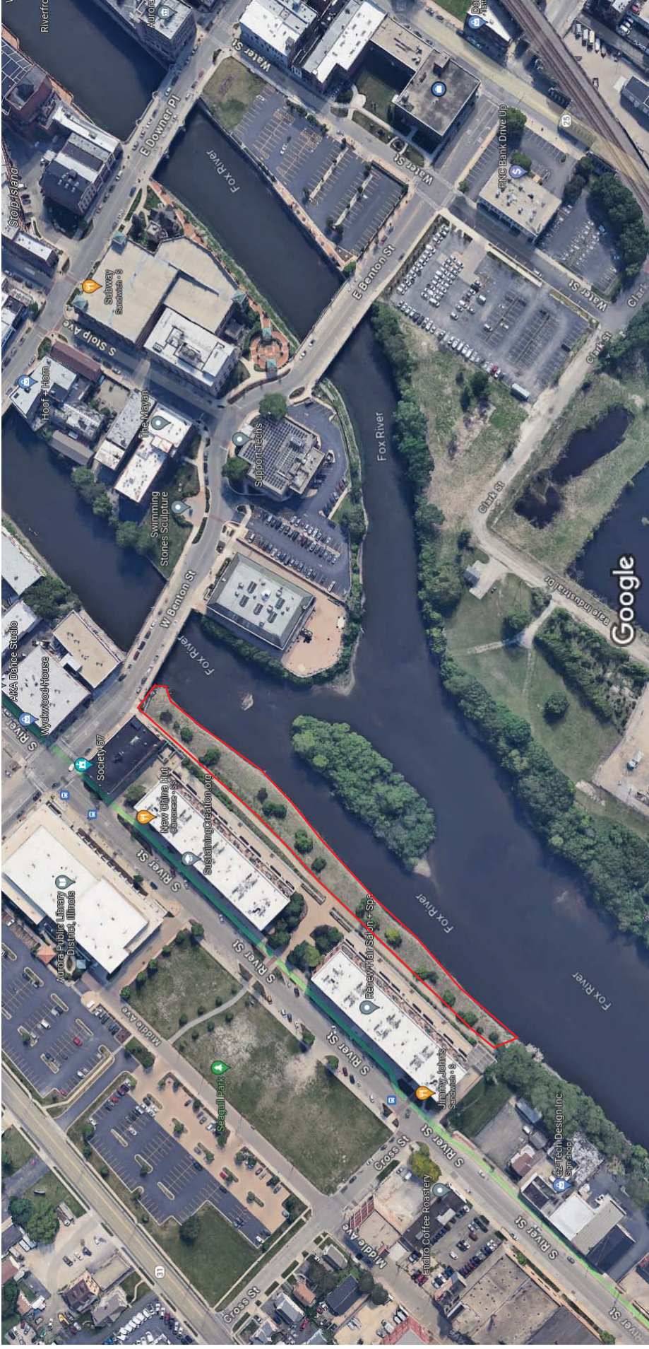
Riverwalk behind River Street Plaza @ Benton St - approximately 2.5 acres