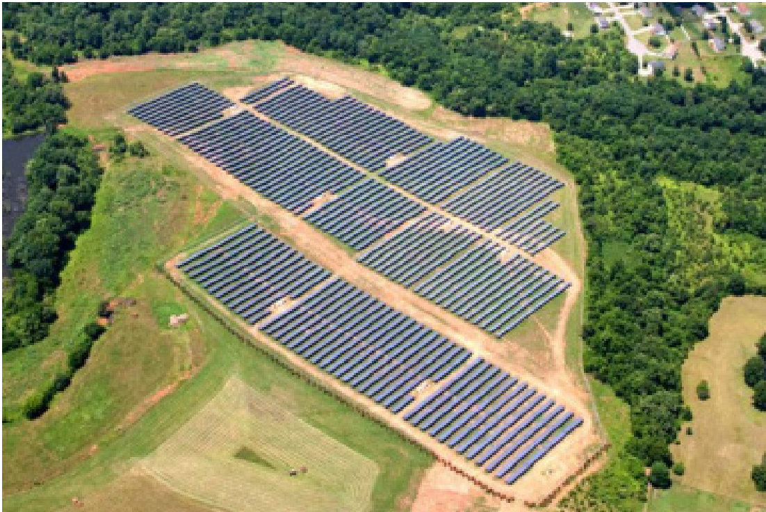
Figure 1: Utility-scale solar facility (5 MWAC) located in Catawba County.

The system installation, or construction, process does not require toxic chemicals or processes. The site is mechanically cleared of large vegetation, fences are constructed, and the land is surveyed to layout exact installation locations. Trenches for underground wiring are dug and support posts are driven into the ground. The solar panels are bolted to steel and aluminum support structures and wired together. Inverter pads are installed, and an inverter and transformer are installed on each pad. Once everything is connected, the system is tested, and only then turned on.